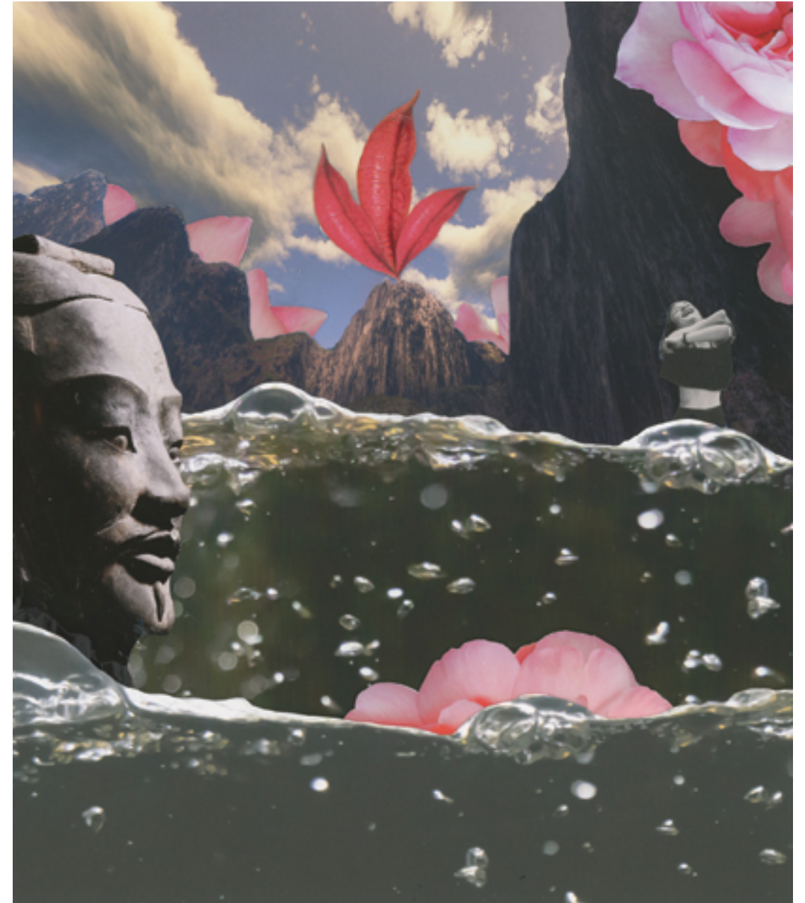
Watery Depths of Imagination