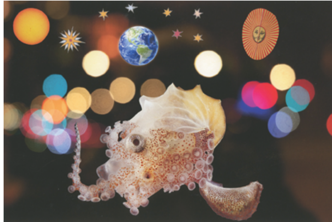
The Edge of Perception